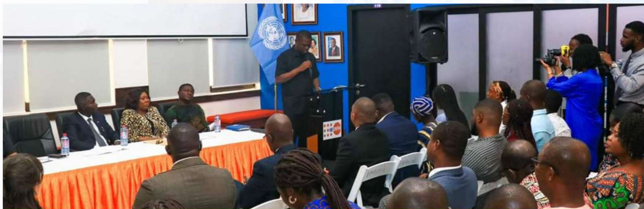
Minister for Youth and Sports, Hon. Mustapha Ussif engaging the audience and the media on efforts to develop a National Action Plan

The journey towards developing Ghana's YPS NAP began with a pivotal Training of Trainers (TOT) workshop held in Cameroon in October 2023. Representatives from Ghana's Peace Council, Youth Bridge Foundation, and UNFPA Ghana participated in this event, acquiring valuable knowledge and skills to support the NAP development process.