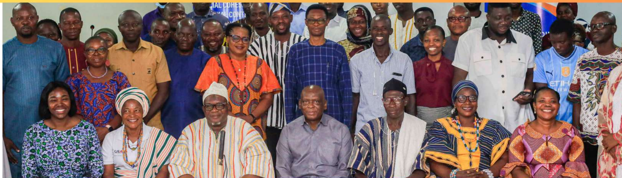
Group picture of members of security agencies and civil society groups in North East, Upper East and Upper West Regions at the training program.

With the support of the United Nations Population Fund (UNFPA) and the Regional Coordinating Councils, a comprehensive training program was organized for members of security services and civil society groups across three regions. The primary focus of this training was to adopt a human-rights approach, aiming to empower local communities to claim their rights and hold individuals and institutions accountable for respecting, protecting, and fulfilling those rights. The training was rooted in key international principles such as "do no harm," universality, indivisibility, equality, non-discrimination, participation, and accountability. It also emphasized gender and youth responsiveness in all security approaches, safeguarding women and youth from violence and abuse.