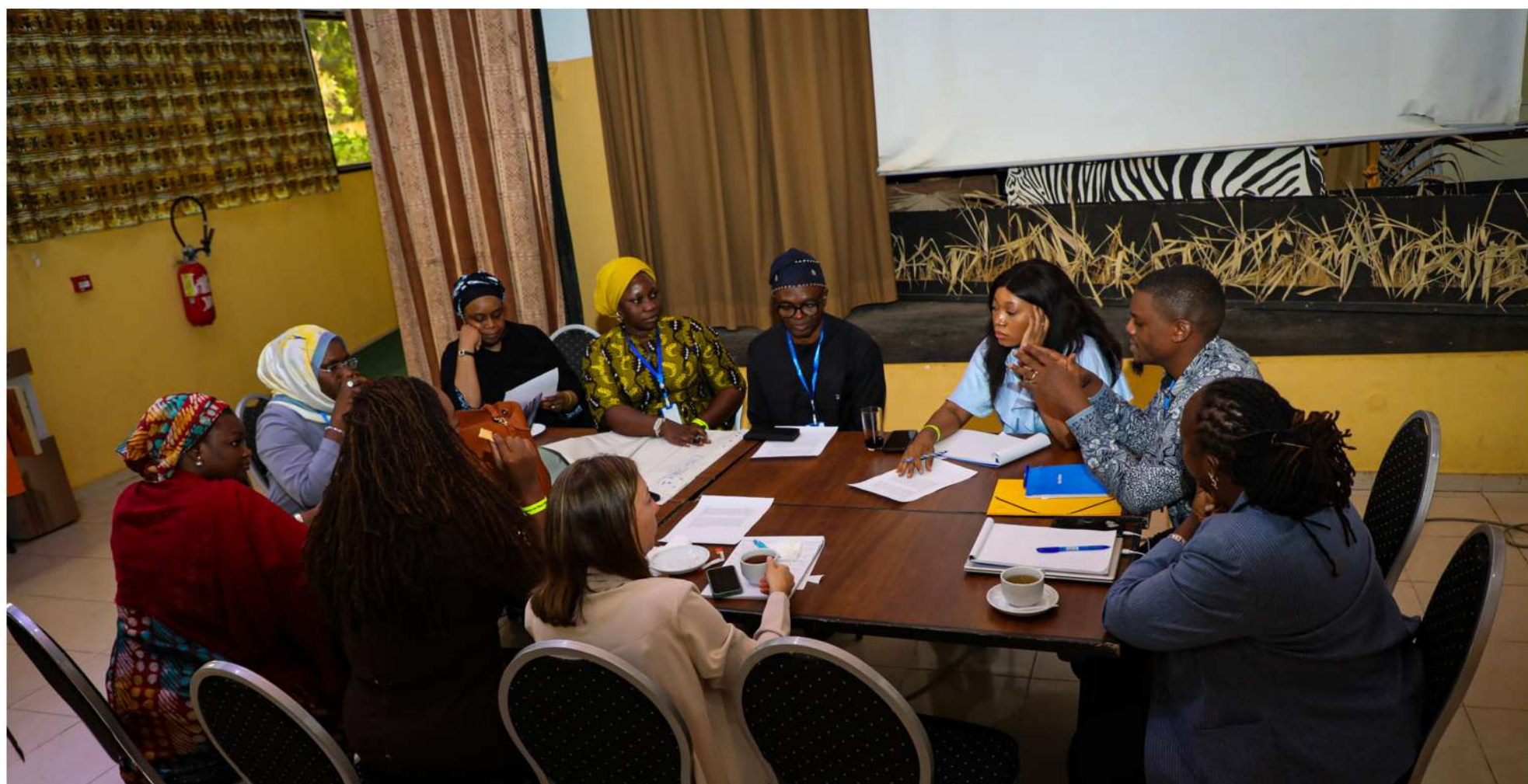
Regional Officers and Traditional Council Registrars taking part in training on ending Gender-Based Violence (GBV) and combating harmful practices

A key partner in this initiative has been the Ministry of Chieftaincy and Religious Affairs, whose collaboration has been instrumental in facilitating the training. The Ministry's involvement underscores the importance of engaging traditional leadership structures in combating harmful practices.