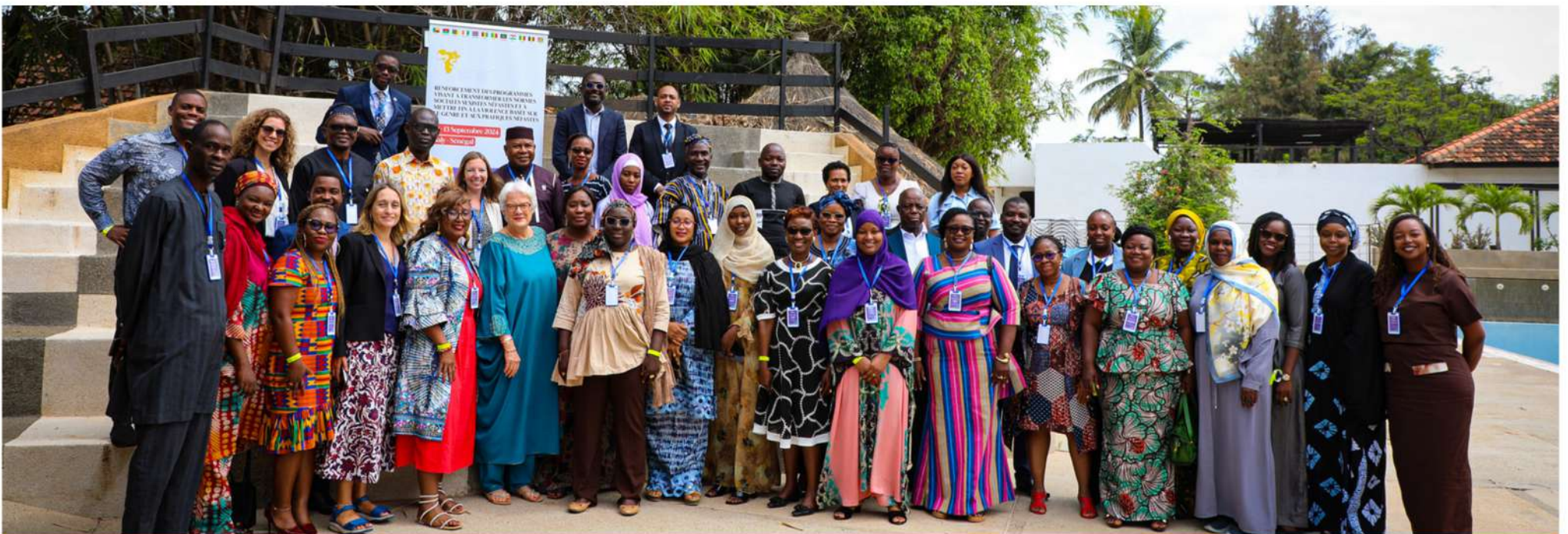
Group photograph of participants at the training session held in Dakar, Senegal