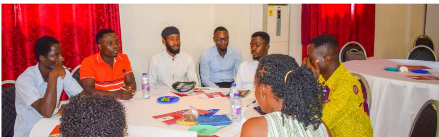
A group of young people undergoing training organized by UNFPA and WFP for youth in SRHR and GBV

UNFPA Ghana, in collaboration with the World Food Programme (WFP), successfully conducted consultations for youth involved in the agricultural businesses with a focus on Agri-Tech innovations. The initiative aimed to engage young people to explore their perspectives on the application and advancement of agriculture as means of sustainable livelihoods and food security through the adoption of technology for agricultural practices by young people.