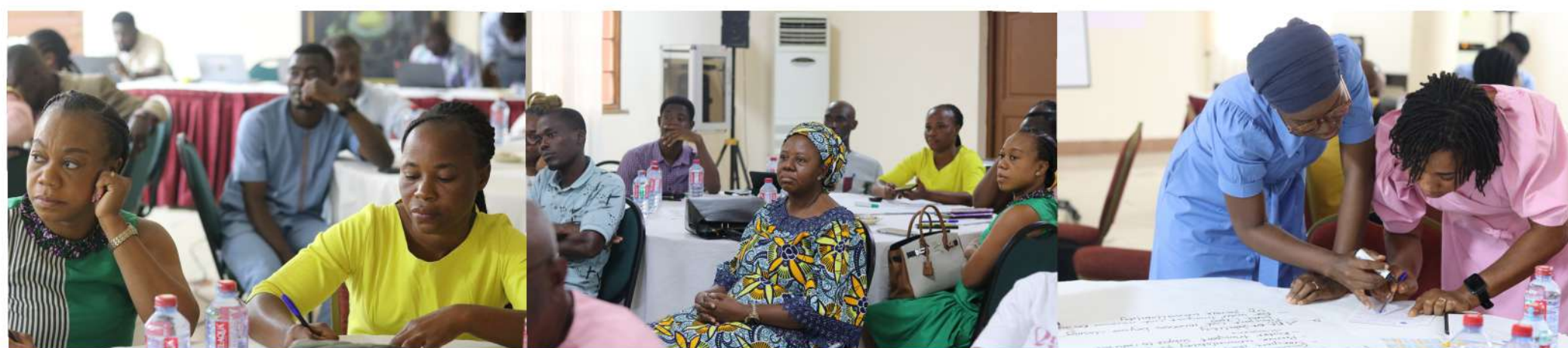
UNFPA Ghana with partners at the co-creation workshop of TIMER project to end 2nd delay in maternal mortality

UNFPA Ghana through a private-public partnership rolled out the implementation of the TIMER ( T ransport I nnovation for M aternal H ealth E mergency R escue) project to address the 2nd delay in Maternal Mortality i.e., delay in reaching the health facility. The innovative project seeks to develop an Application (Uber-like) or adapt existing solutions that create an interface between the accredited transport providers at the Ghana Private Road Transport Union (GPRTU) and potential clients and enable beneficiaries to save.