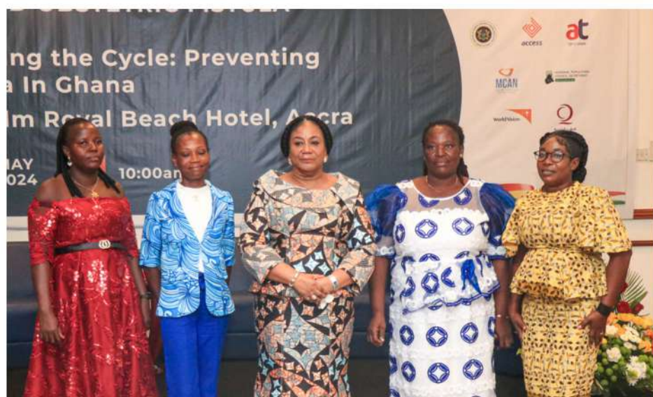
First Lady of the Republic of Ghana, Her excellency Rebecca Akuffo and some Obstetric Fistula survivors at the La Palm Royal Beach Hotel in Accra.