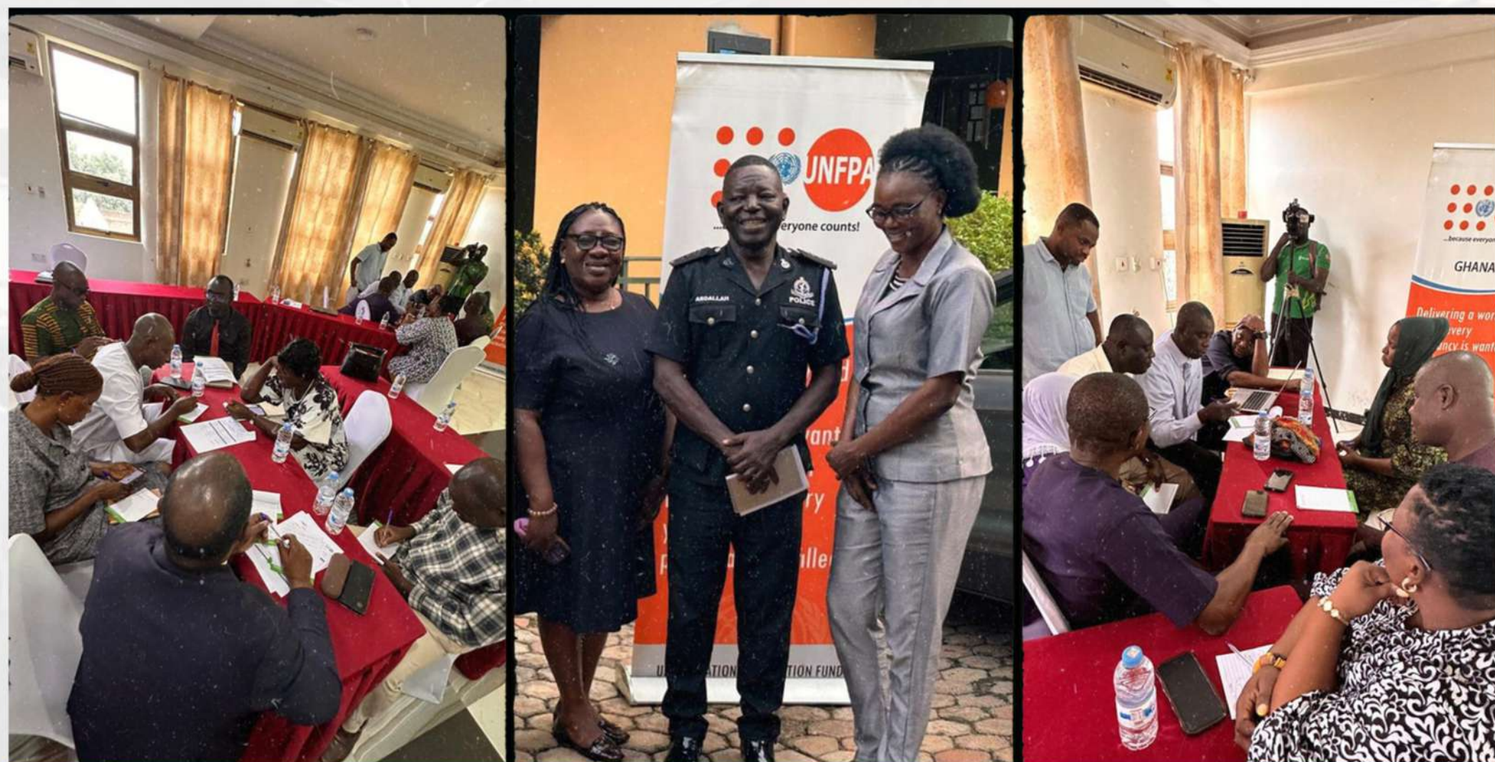
Partners undergoing training on Essential Service Packages (ESP) for women and girls subject to Gender-Based Violence (GBV)

A midyear review was conducted to assess the project's progress, offering an opportunity for implementing partners to present their achievements, share successes, highlight best practices, and discuss challenges encountered in executing their components. This review also served as a platform to ensure the continued commitment to the Prevention of Sexual Exploitation and Abuse (PSEA), especially in the context of working with vulnerable and marginalized groups.