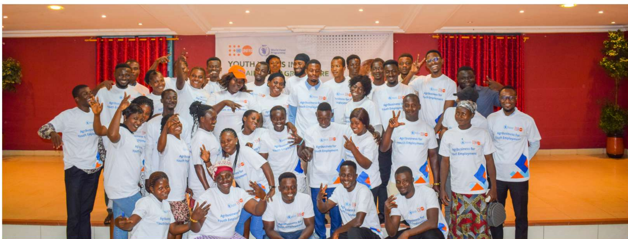
Participants of the Training to Empower Youth in Agriculture, SRHR AND GBV