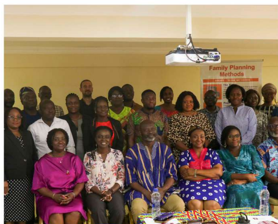
Stakeholders from government, civil society, private sector, and academia at the SMART advocacy workshop.

Further plans include engaging Ghana's Parliamentary Health Committee to elevate 3 TRs as a priority in policymaking and explore opportunities to integrate FP funding into national budgeting processes.