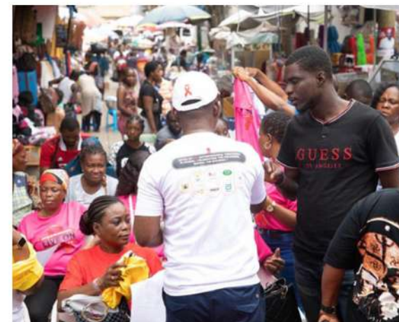
Miss Malaika Ghana and team at Makola Market for HIV Prevention outreach