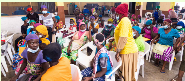
A cross-section of the Kayayei.

The AU Youth Envoy and her team visited the field to get first-hand knowledge of development interventions targeted at marginalised girls, often referred to locally as kayayei, who are head porters that migrated from Northern parts of Ghana to the Central Business District of Accra to make a living.