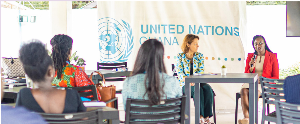
The AU Youth Envoy in a dialogue with members of the UN Youth Group in Ghana.