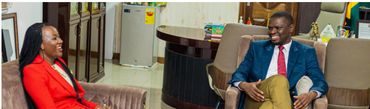
Ms. Chido Mpemba(left) in a tête-à-tête with the Ghana's Minister of Youth & Sports, Hon. Mustapha Ussif.

The Envoy also paid a courtesy call on the Minister of Youth and Sports of Ghana, Hon Mustapha Ussif. At this meeting, the AU Youth Envoy briefed the Minister on the 60 Days Listening Tour Campaign. She emphasised the critical need for enhanced collaboration between her office and the office of the Minister of Youth and Sports, as well as the various Agencies that play critical roles in youth empowerment and development in Ghana, as is her interest for all the other Member States of the AU.