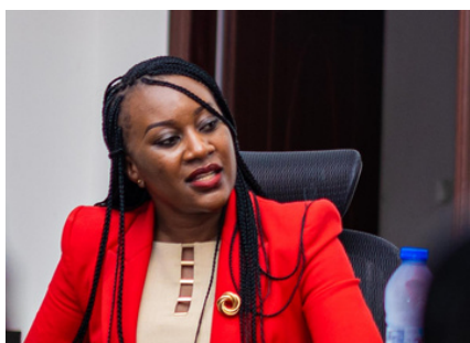
The AUYE providing details about the 60-Day Listening Tour Campaign.

Embassy will be willing to assist in whichever way may be required.