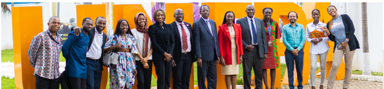
The UNFPA Ghana Organizing Team with the AU Youth Envoy and her team in a group photograph.