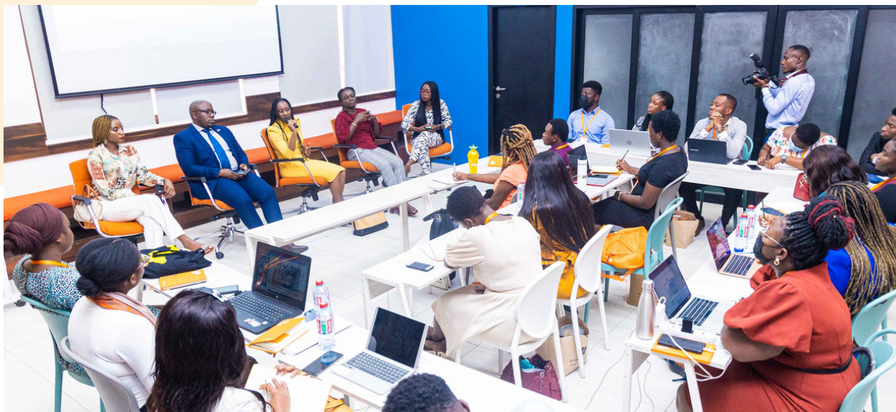
The AU Youth Envoy and her team in an interaction with the YoLe Fellows.

The AU Youth Envoy and her team also visited the Orange Loft, a Youth Innovation Hub designed by UNFPA Ghana to hone the skills of young graduates in Ghana, while equipping them with in-depth knowledge of UN operations and the larger Sustainable Development ecosystem. The space also allows for co-working and hosting events, with state-of-the-art facilities adapted to be youthful and to enable the fellows to be highly productive.