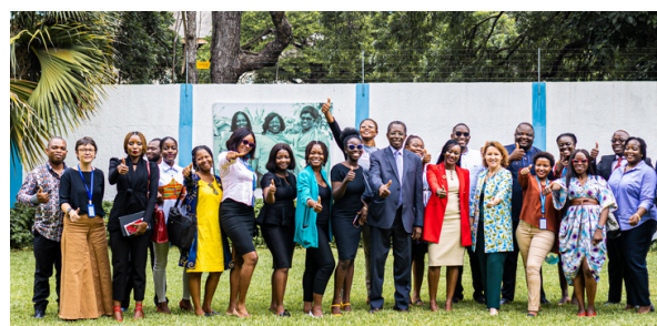
The AU Youth Envoy and members of the UN Youth Group.

The AU Youth Envoy mentioned the opportunity that is available to the UN agencies and member states to assign youth to her office on secondment so that there can be more young people like her to support the enormous work that needs to be carried out by the Office of the AU Youth Envoy. The meeting allowed for an exchange of ideas around resource mobilisation, programming, and other areas of partnerships to advance the cause of young people in Ghana and across the continent.