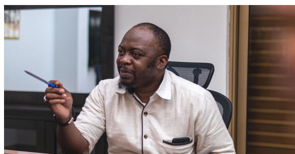
The Deputy Ambassador making a point during the meeting.

The Deputy Ambassador of Zimbabwe to Ghana cordially received the AU Youth Envoy and her team together with some UNFPA Staff. The plenipotentiary introduced the Envoy to the work the mission was doing in Ghana, mainly in the areas of attracting investment to Zimbabwe in the context of the African Continental Free Trade (AfCFTA). He took time to also wish her well and gave an assurance that the