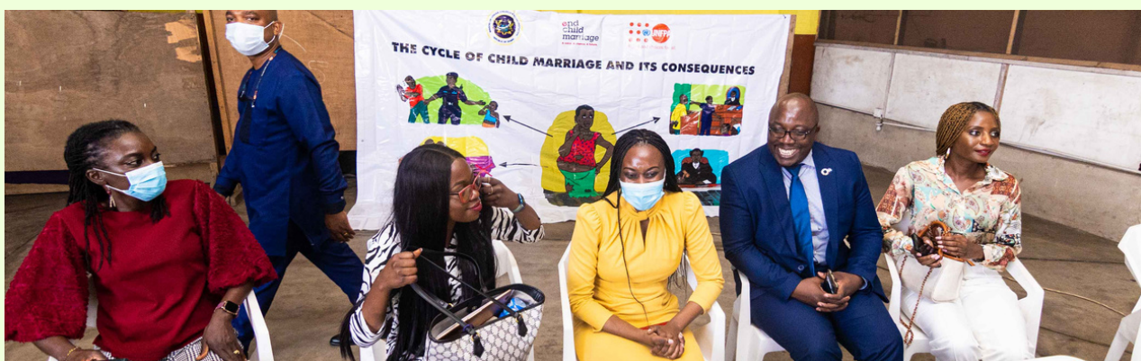
The AU Youth Envoy held close interaction with over 60 Marginalised Girls.